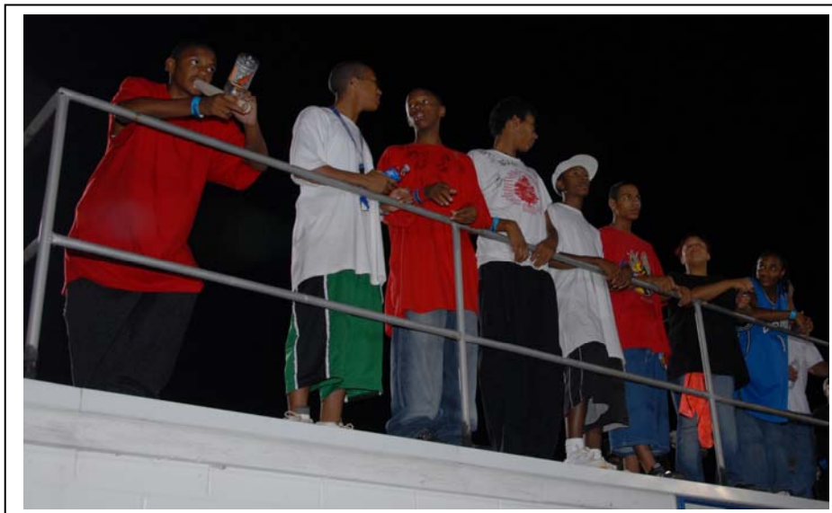
Members of the Future Business Leaders of America from nearby Martinsville High School take in the Made In America Whelen 300.