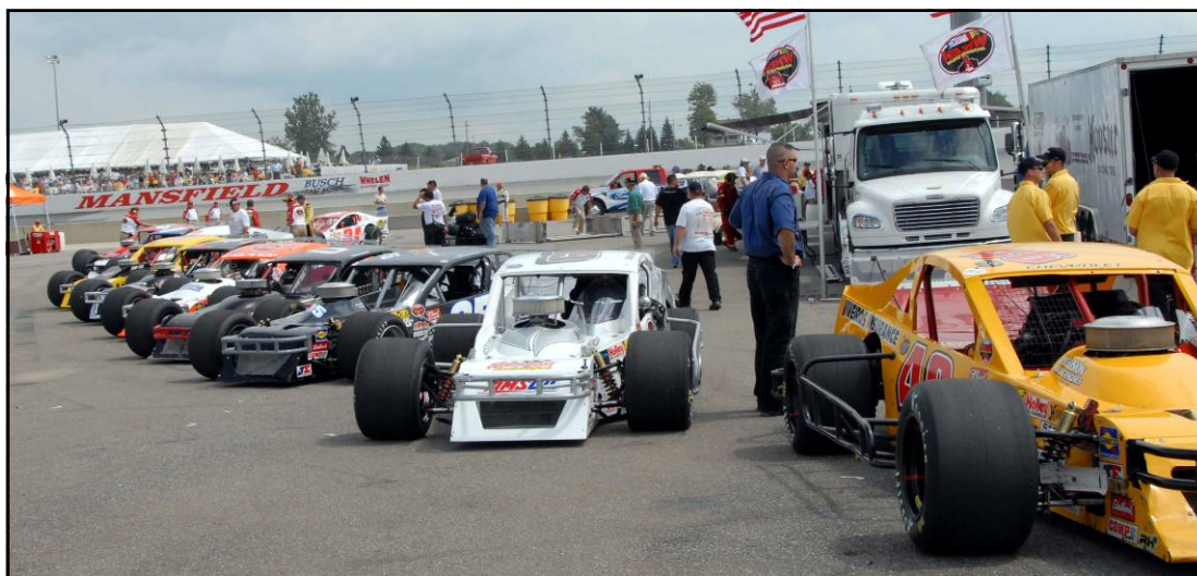
Mansfield Motorsports Park will be the site of the Whelen 150 on Saturday.