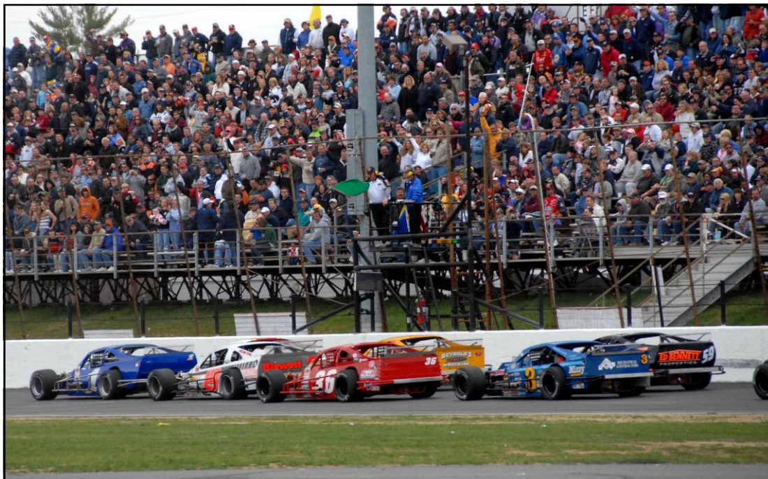
This weekend will mark the fourth and final trip for the NWMT to Stafford in 2008.