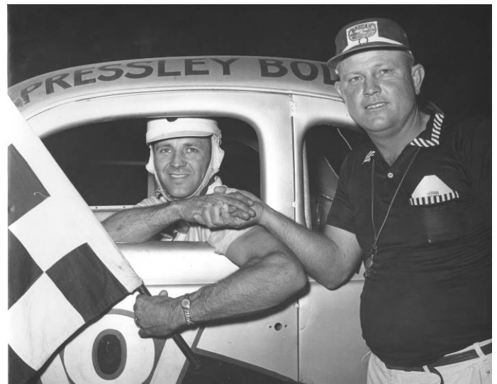
The late Ralph Earnhardt celebrates in Victory Lane at Bowman Gray Stadium.