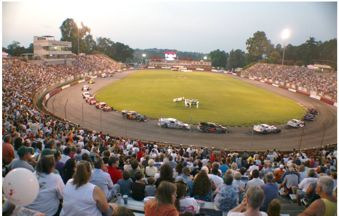
The crowd at Bowman Gray Stadium looks on during the NASCAR Whelen All-American Series Modified feature last Saturday night.