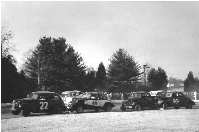
The Modified division has a long history of racing at Bowman Gray Stadium.