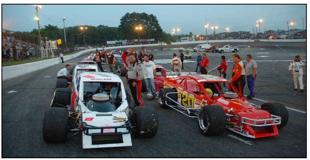
The NASCAR Whelen Modified Tour will return to the quarter-mile Riverhead (N.Y.) Raceway for the 25th season in a row this Saturday for the Riverhead 175.