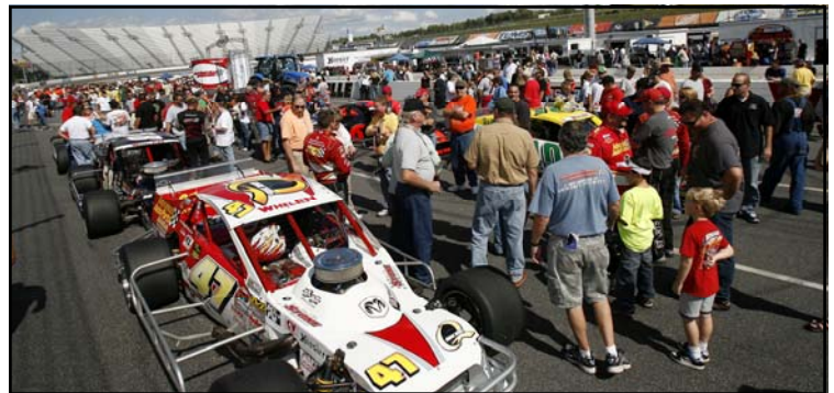
The on-track autograph session at Martinsville is a fan favorite.