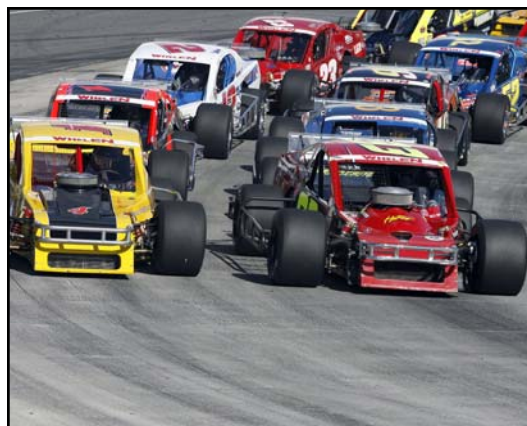
The 2010 Made In America Whelen 200 will be the 35th all-time Whelen Modified Tour race at Martinsville, the most at any track outside of the northeast.