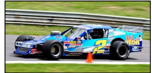
Szegedy was one of four drivers that tested Lime Rock for Hoosier Tire in May.

The only road course "ringer" expected to