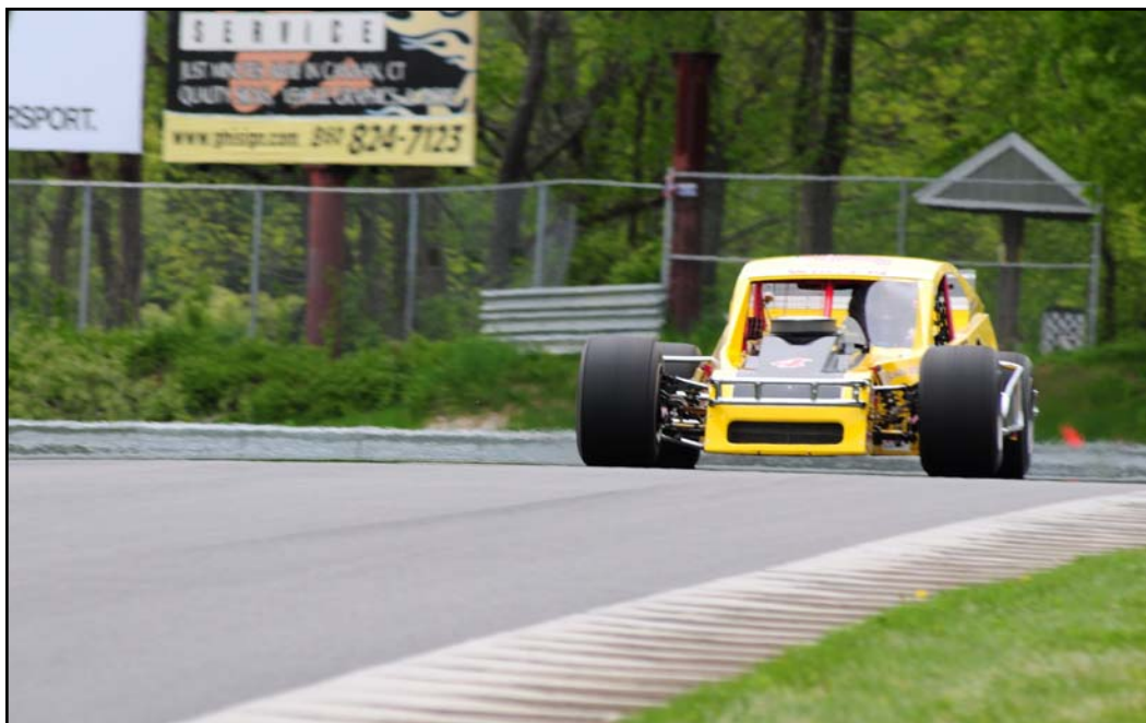
The NASCAR Whelen Modified Tour is set for its inaugural race at Lime Rock Park.