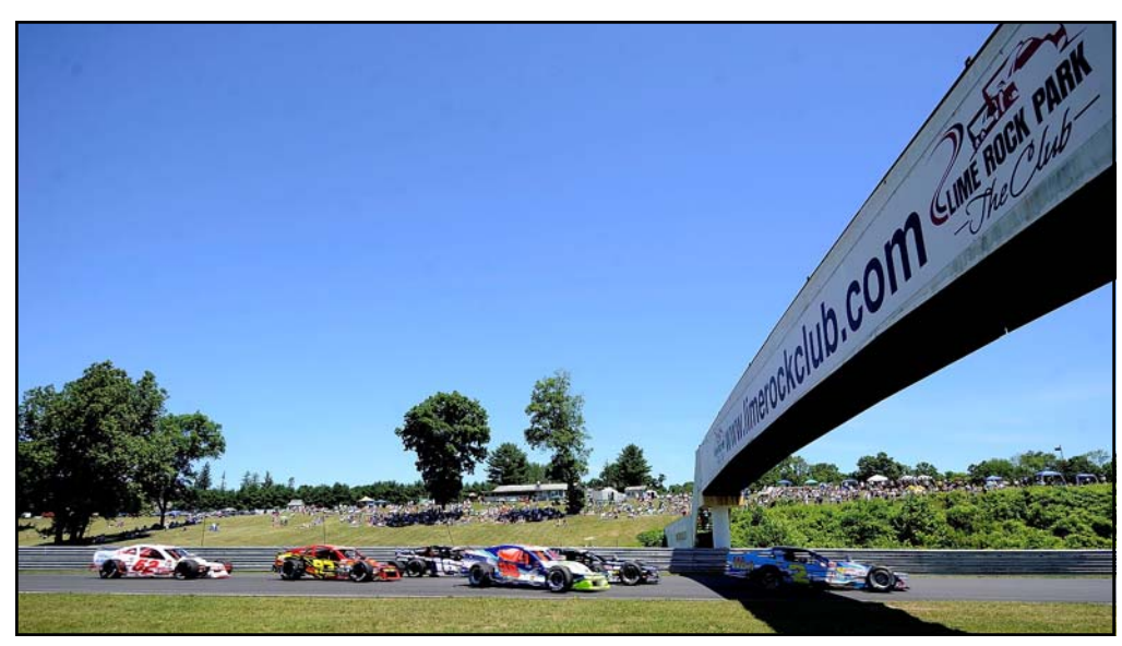
The inaugural Whelen Modified Tour race at Lime Rock took place on July 3.