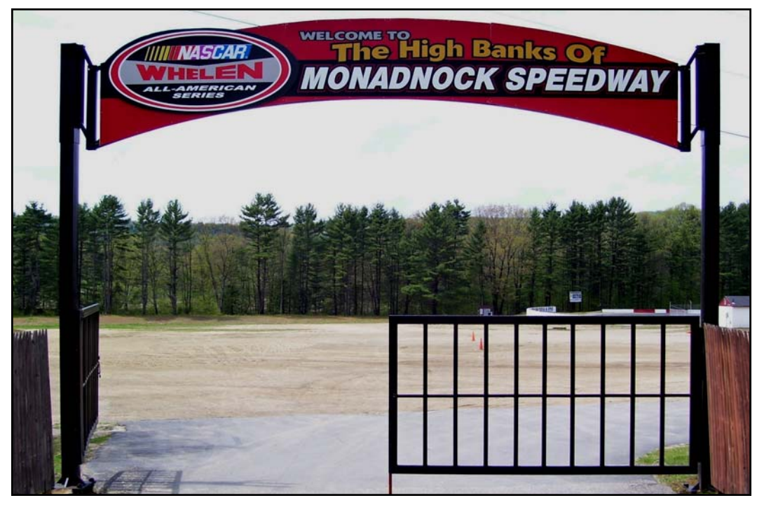
Monadnock's high banks will play host to the Whelen Modified Tour for the first time since 1990.